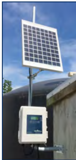
Transmitter on tank