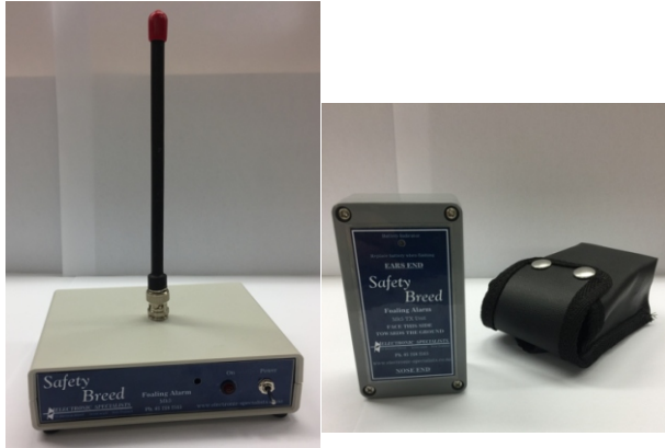
Receiver /Transmitter / Pouch