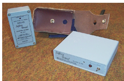
Transmitter / Pouch / Receiver